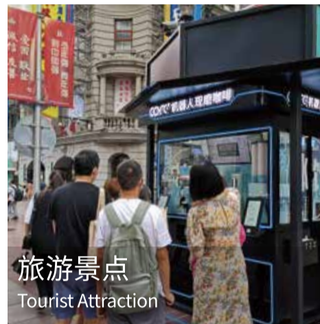
旅游景点 Tourist Attraction