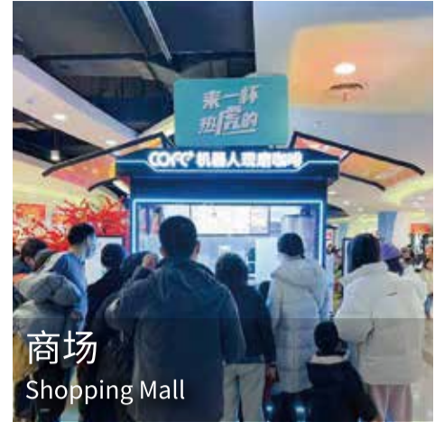
商场 Shopping Mall