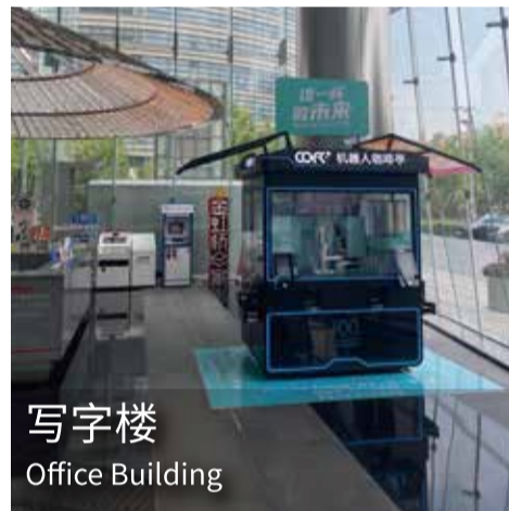
写字楼 Office Building