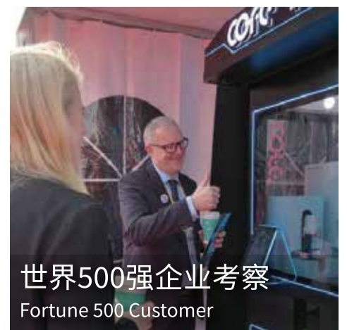
世界500强企业考察 Fortune 500 Customer