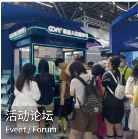
活动论坛 Event / Forum