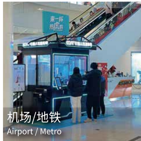
机场/地铁 Airport / Metro