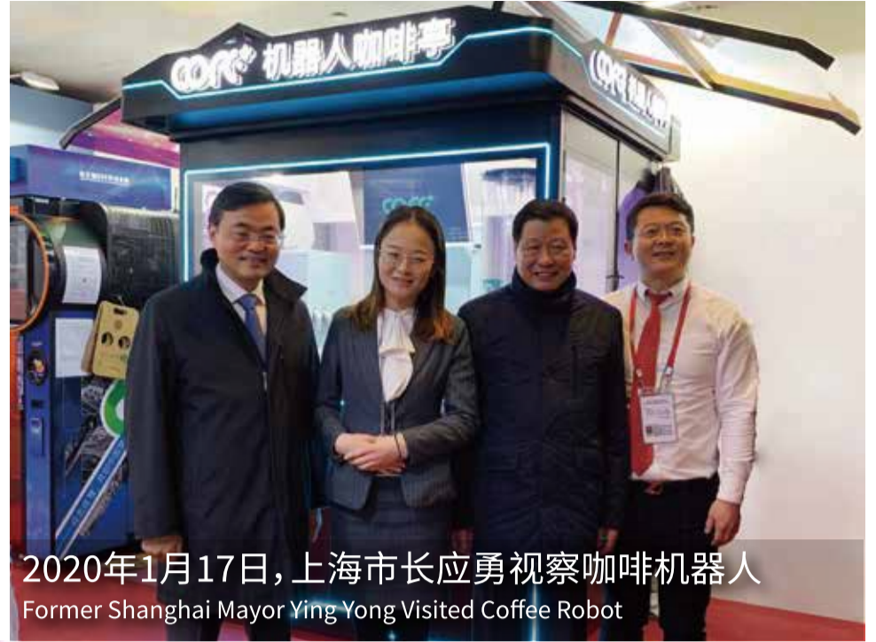
2020年1月17日, 上海市长应勇视察咖啡机器人 Former Shanghai Mayor Ying Yong Visited Coffee Robot

A 24-hour coffee shop service day and night