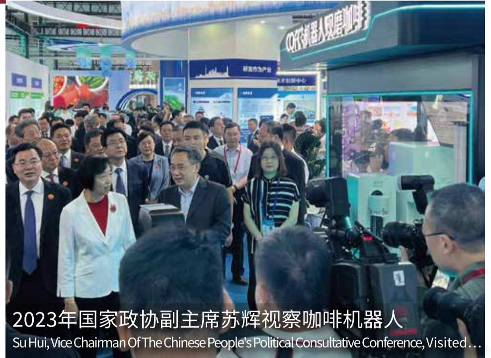
2023年国家政协副主席苏辉视察咖啡机器人 Su Hui, Vice Chairman Of The Chinese People's Political Consultative Conference, Visited...

A robot café that achieves intelligent taste management and update system