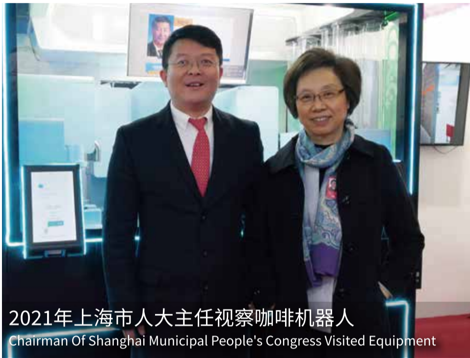
2021年上海市人大主任视察咖啡机器人 Chairman Of Shanghai Municipal People's Congress Visited Equipment

5 customizations: free selection of beverage concentration/temperature/sweetness/iced/topping type, even with or without a lid