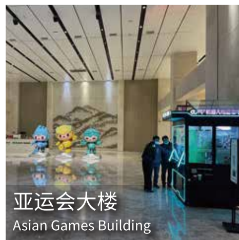
亚运会大楼 Asian Games Building