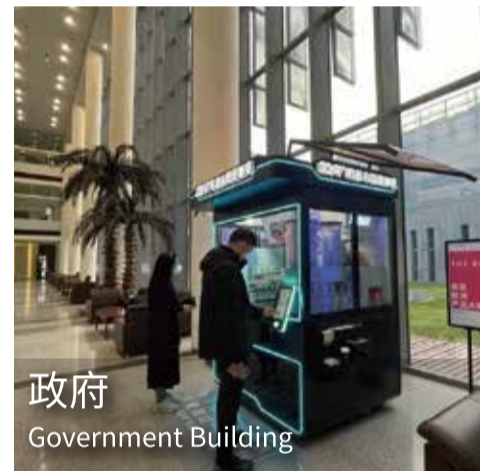
政府 Government Building